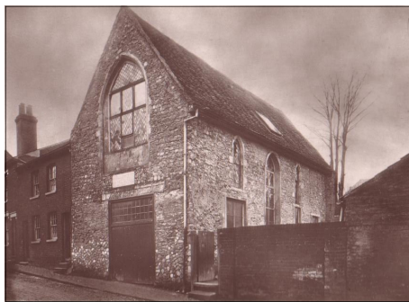
St Helen's Chapel as a workshop, not long before 1886, when it was restored as it is today - though it did not become a church again until 2000, after 461 years in other use! Note the garage-like door in the east wall, the extra window in the north wall, and the houses on the right, close to the church, which were demolished.

Hieromartyr Polycarp, 70-156, Bishop of Smyrna, feast 23 Feb