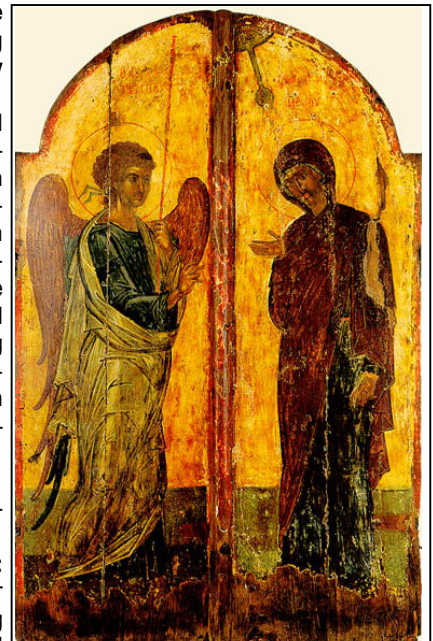
The Annunciation, 25 March, nine months before the Nativity, celebrates the human conception of Christ, when the Holy Spirit came upon Mary and she accepted to give birth to the Son of God. Falling on a Sunday this year, it takes precedence, because so important a feast, over the Sunday of Lent.

The Saint died in 543 AD; his life was written by Pope St Gregory. His feast is 14 March. As an Anglican I had the privilege of being a Benedictine Oblate for several years: it gave stability in Christian living by attachment to a real and holy monastery.