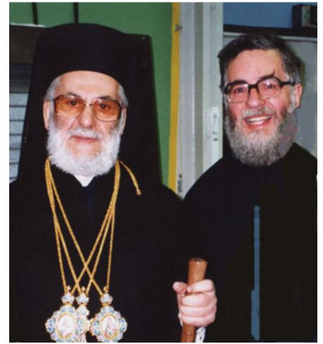
HB Patriarch Ignatius IV of Antioch at St George's Cathedral in London in 1997

The Times published a full-page obituary on 28 December 2012, and the following item on 8 January 2013: