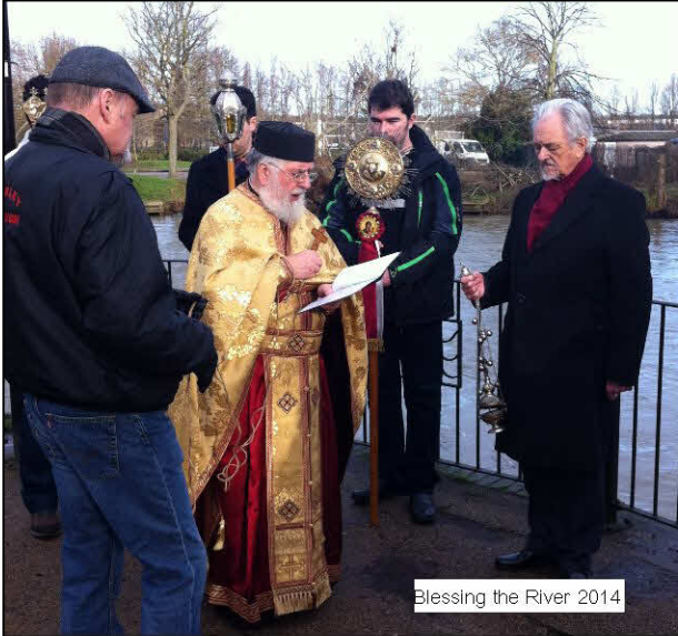
Blessing the River 2014

Blessing of the River Sunday 18 January 11.30 am Procession from Church after 10.30 am Holy Liturgy