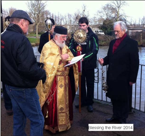
Blessing the River 2014

THE THEOPHANY ICON shows Christ being baptised by John, the Forerunner and Baptist, at the River Jordan. Above Christ is shown the coming forth of the Father's Word This is my beloved Son , and the Holy Spirit in the form of the Dove. Thus the Three Persons of the Holy Trinity are revealed for the first time. The Holy Angels gather in adoration of the Triune God. The faithful collect some Holy Water after the Great Blessing in Church, and request the Priest to bless their home.