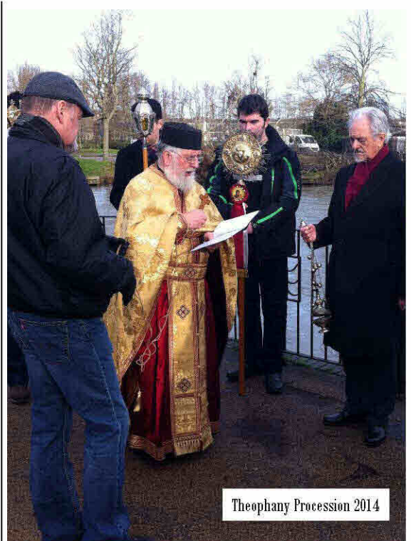
Theophany Procession 2014