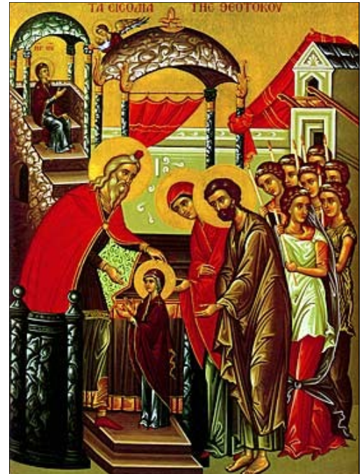
On the Entry of the Theotokos into the Temple (above), Thursday 21 November, there will be Holy Liturgy at 9.30 am.

In preparation for the new situation of owning a building, there will be an Extraordinary General Meeting on Sunday 24 Nov after the Liturgy, only 5 minutes long , to change the Parish Constitution so as to allow members of the Church Council to be Trustees, without personal financial responsibility. Then a 5 minute meeting for Council members to deal with the new situation.